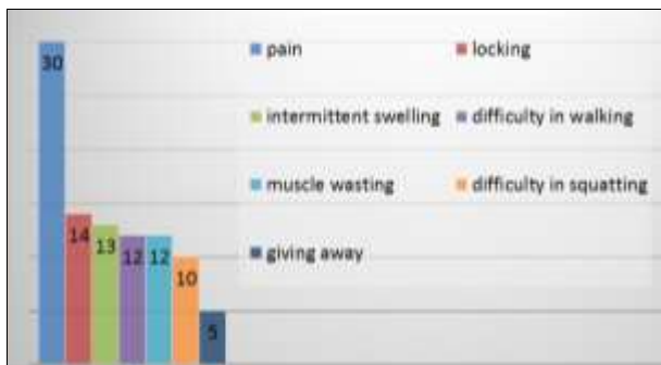
Fig 1: Distribution of study population according to clinical features (n=30)

meniscus tear in this study. 5 (16.67%) cases arthroscopic partial meniscectomy was performed within 6 months of occurrence of lateral meniscus tear of knee and 25 (83.33%) cases arthroscopic partial meniscectomy was performed after 6 months of occurrence of medial meniscus tear of knee.