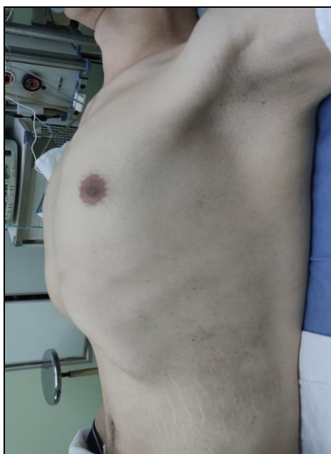
Fig 1: Chest wall appearance before operation.

This patient is an adult male and is the most common type of barrel chest patient. During the operation, we used 3 steel bars. After proper placement and fixation, we achieved satisfactory results.