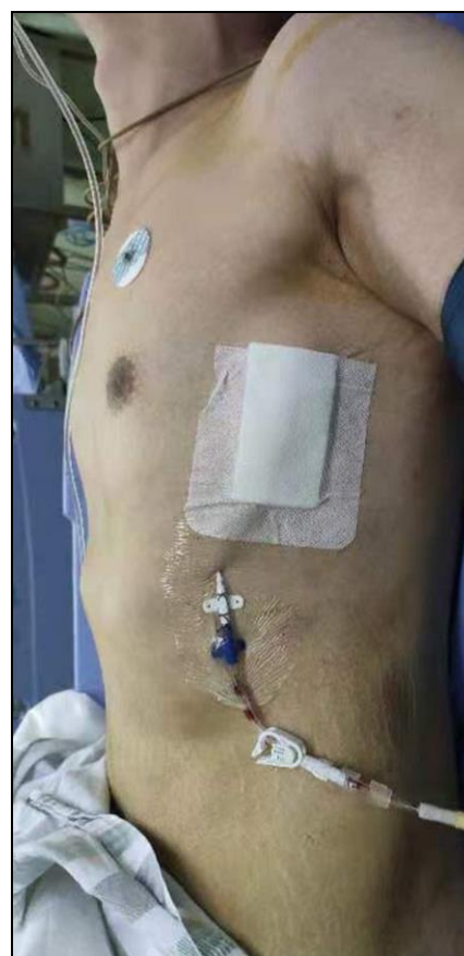
Fig 4: Chest wall appearance after operation.