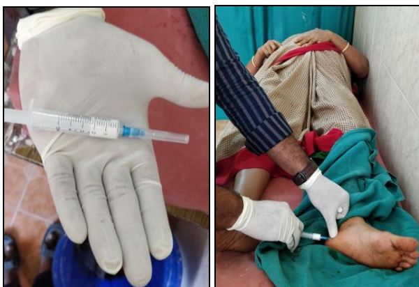
Fig 5: Corticosteroid Injection Application