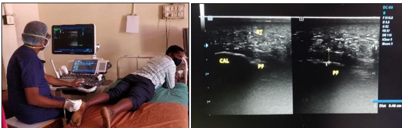
Fig 2: Ultrasonic Evaluation of Plantar Fascia Thickness

A diagnostic ultrasound machine with a 4 cm wide transducer head and 8 MHz probe was used [22]. The thickness of the plantar fascia was measured at the thickest portion from the base of the medial calcaneal tubercle where a bright echogenic line was easily visible. Plantar fascia thickness of more than 4mm was considered abnormal [1].