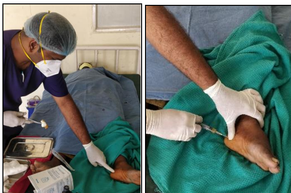
Fig 4: PRP injection technique

The procedure was done in a OPD basis under strict aseptic precautions [16, 18]. Patient lying in supine position the site of maximal tenderness over the medial calcaneal tubercle is identified. [fig 4] 2cc of 2 ml lidocaine is injected into the skin before PRP application. A ‘peppering’ 19 technique i.e., spreading in clockwise manner was used to achieve a more expansile zone of delivery over the plantar fascia [a single portal and 4 to5 passes through the fascia itself]