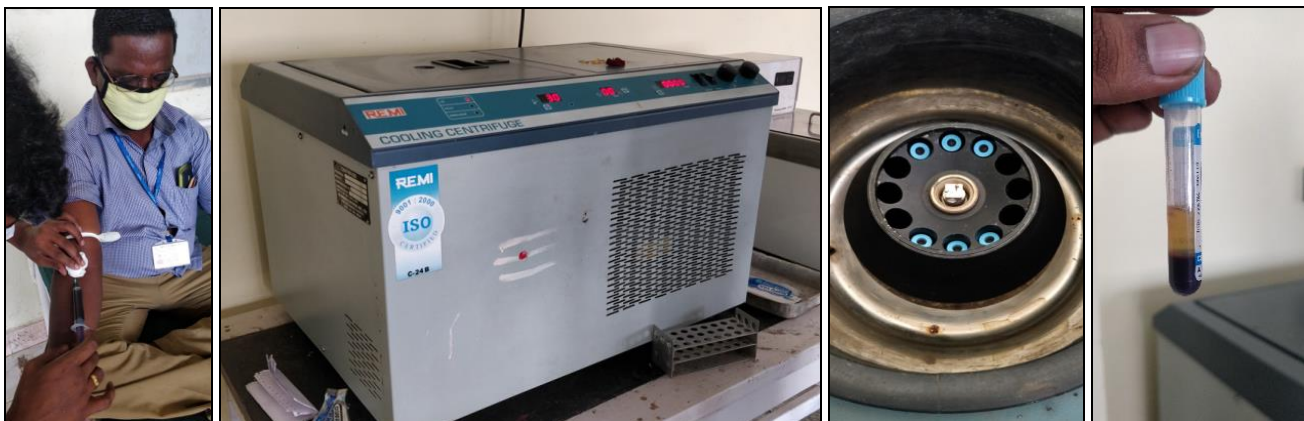
Fig 1: PRP preparation

Under strict aseptic precautions, [fig 1] 10 ml of patients own venous blood was withdrawn from cubital vein and was collected in pre sterilized centrifuge vials [17]. The centrifuge vials was loaded with anticoagulant acid citrate dextrose. The blood was then centrifuged in a cooling centrifuge [REMI] at a rate of 3200 rpm for 20 minutes. The blood is then separated in platelet poor plasma and platelet rich plasma. The platelet poor plasma is discarded and the PRP is collected in a syringe [26].