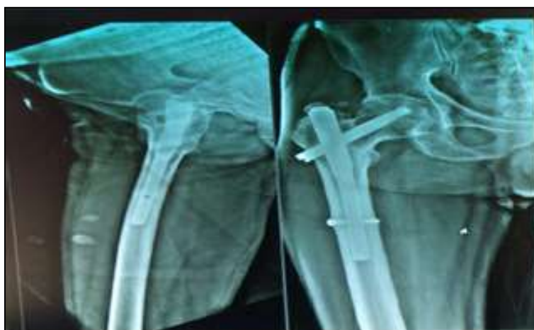
Fig 4C: X ray 6 months follow up