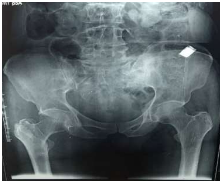
Fig 4A: Pre op X-ray