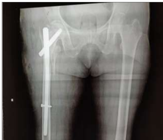
Fig 5B: Xray at 6 weeks follow up