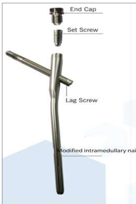
Fig 3: Modified intramedullary implant and its parts

modified intramedullary implant system is designed to facilitate minimally invasive surgery and reduce the operative time down to minimum by the aid of using new instrumentation and optimized surgical technique. The lag screw (fig 3) system is designed for advanced hip fracture treatment with rotational stability design. The lag screws are designed to transfer the load of the femoral head into the nail shaft by bridging the fracture line to allow fast and secure fracture healing. The thread design of the lag screw also offers excellent grip in the cancellous bone of the femoral head and strong resistance against cut-out. Specially four grooves are designed on the lag screw, so that the Set screw will be engaged which will help to fix lag screw and avoid rotational and medial migration of lag screw. The aim of this retrospective study was to evaluate this relatively new implant in our local population.