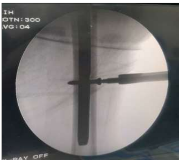
Fig 1B: Intra-op images showing distal screw insertion