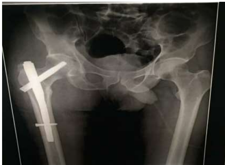
Fig 4B: Xray at 6 weeks follow up