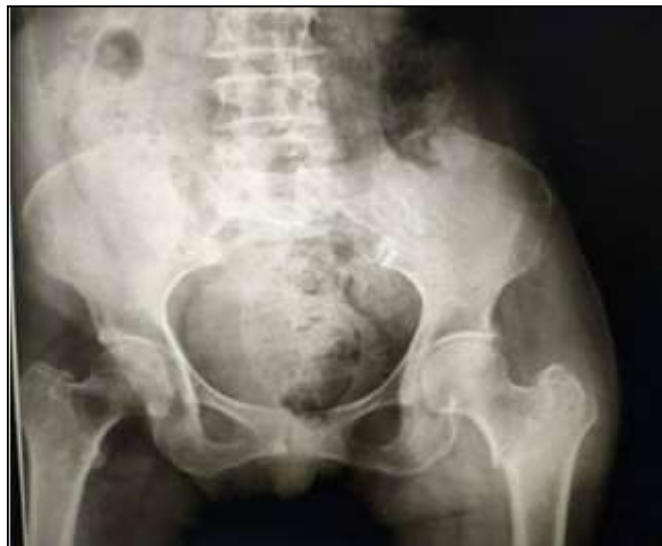
Fig 6A: Pre-op xray