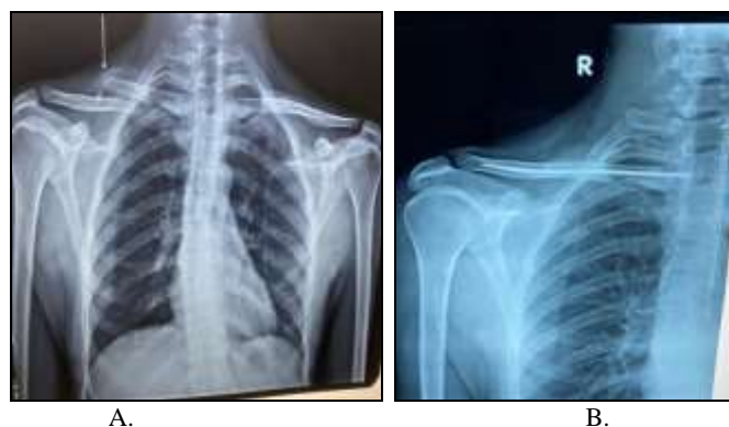
Fig 2: a) Preoperative radiograph of a 32 yr old manual labourer. b) Follow up radiograph at 6 th month.