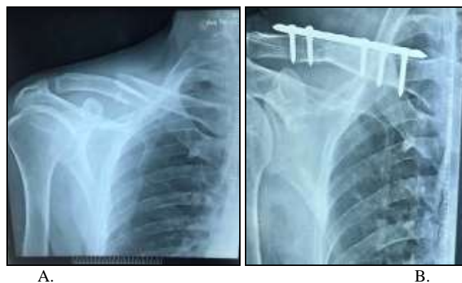
Fig 1: a) Preoperative radiograph of a 45 year old female. b) Follow up radiograph at 6 th month