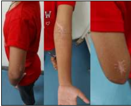
Fig 6A: Suture Scars