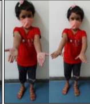
Fig 6C: Supination and Pronation