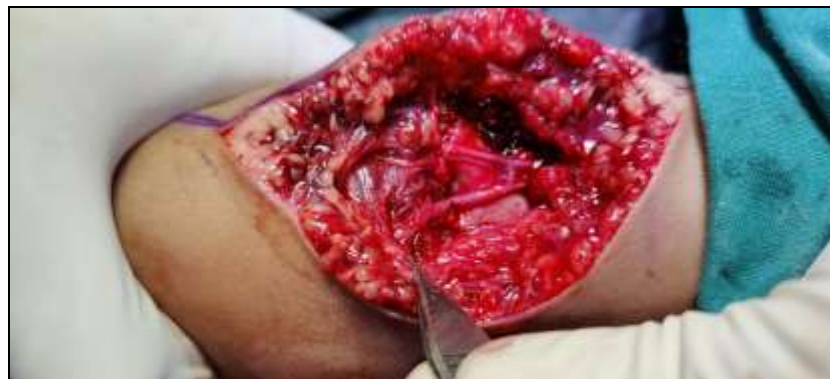
Fig 3A: Kinking of the brachial artery