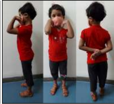
Fig 6: B. Flexion At The Elbow Joint