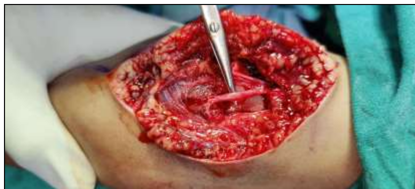
Fig 3B: Released brachial artery