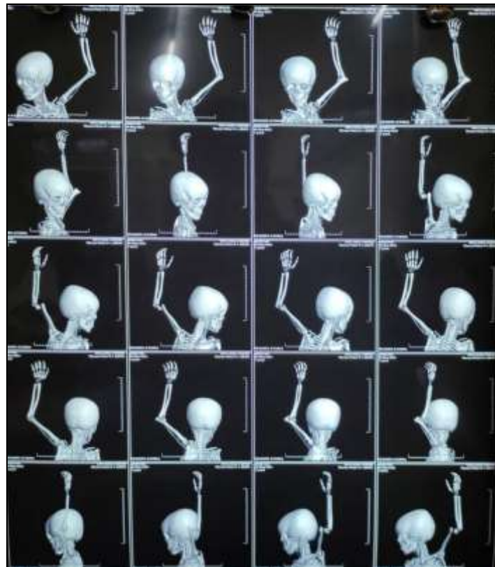
Fig 2A: Shows in X-ray CT Angiogram with 3D Reconstruction