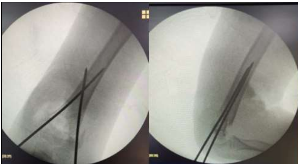
Fig 4: C-arm images in AP and Lateral views of elbow joint showing cross pinning with K-wires