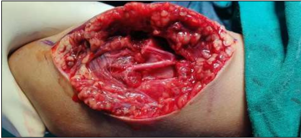
Fig 3C: Patent brachial artery in the cubital fossa