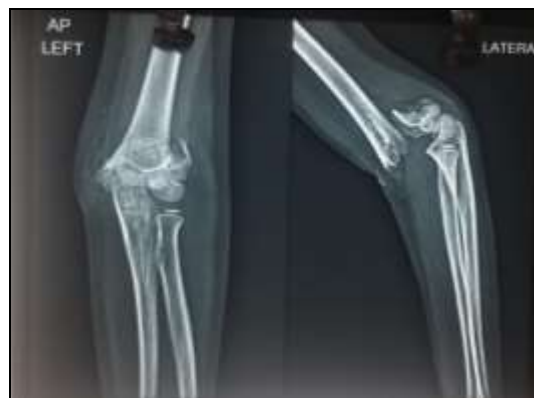
Fig 1: X-ray Left elbow AP and Lateral.