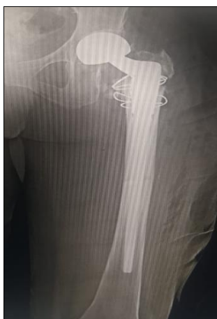
Fig 2: failure of nailing leading to revision with Total Hip Arthroplasty