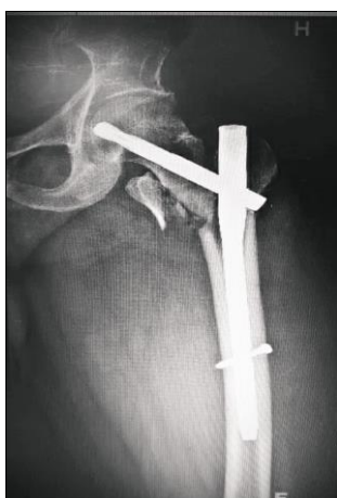
Fig 3: Improper fracture reduction with failure to maintain medial calcar and inferior placement of helical blade (immediate post-op xray)