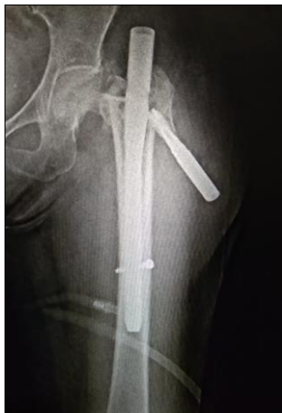
Fig 1: Back out of helical blade in early postoperative period

lavage, debridement followed by prolonged antibiotic medication. No implant was changed, union was achieved at 4 months and no episode of infection was seen during 2 year follow-up. 3 cases of helical blade back out were observed at 2 months (Figure 1). On further evaluation it was observed that there were multiple attempts at insertion of helical blade. 2 of these cases underwent revision surgery with removal of implant and insertion of 1mm broader nail and insertion of newer generation implant with bone cement and helical blade. One case underwent total hip replacement as a revision procedure (Figure 2).