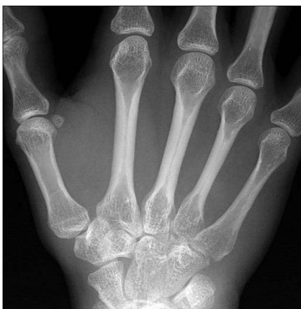
Fig 1: PA hand X-ray showing a fourth MC canal occlusion