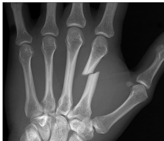
Fig 3: PA hand X-ray showing a second MC canal occlusion and diaphyseal fracture