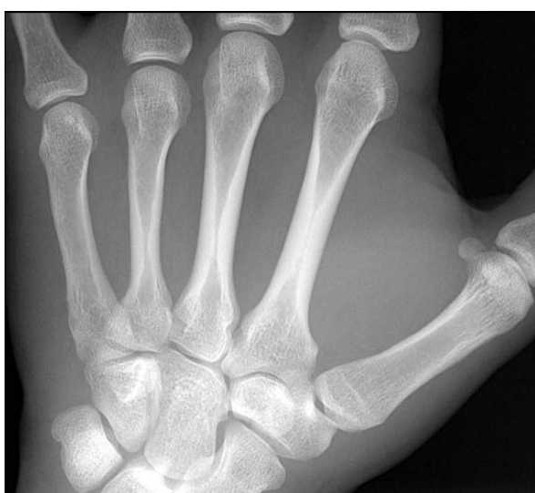
Fig 2: PA hand X-ray showing a second MC canal occlusion