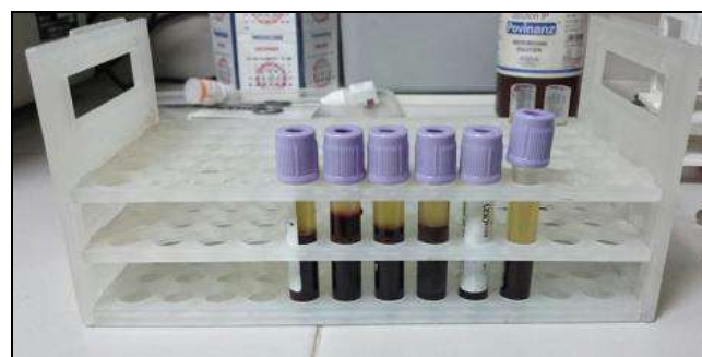
Fig 1: Vacutainers following 15 minutes of centrifuge with 1500 rpm used in single spin PRP.

Single spin technique: 36-ml venous blood sample was collected in 4 tubes (9ml in each). Four tubes were centrifuged at 580g (gyrations) for 8 min, obtaining a concentration suspended in plasma that was extracted by pipetting carefully to avoid leukocyte aspiration. [Figure 1] [Figure 2] Double spin technique: 150ml of whole blood was collected in a double bag having 63 ml of Citrate phosphate dextrose adenine (CPDA) and was stored at room temperature of 20-24 degree Celsius till separation, which was done within one hour of collection. Two centrifugations (the first at 1,800 rpm for 15 min to separate erythrocytes and a second at 3,500 rpm for 10 min to concentrate platelets) were done. Next, blood bag was taken out and supernatant PRP was transferred into the transfer bag under laminar airflow. [Figure 3] This was followed by the sealing of the primary bag with a tube sealer. After one hour of resting, platelets will be re-suspended within the plasma. [Figure 4] A minimum of 15-20ml of PRP was collected and submitted for diagnostic evaluation with regard to the platelet count and relevant serological investigations before being injected into the joint.