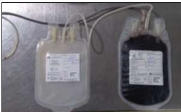
Fig 3: 150ml blood bag with transfer bag used in double spin PRP technique.