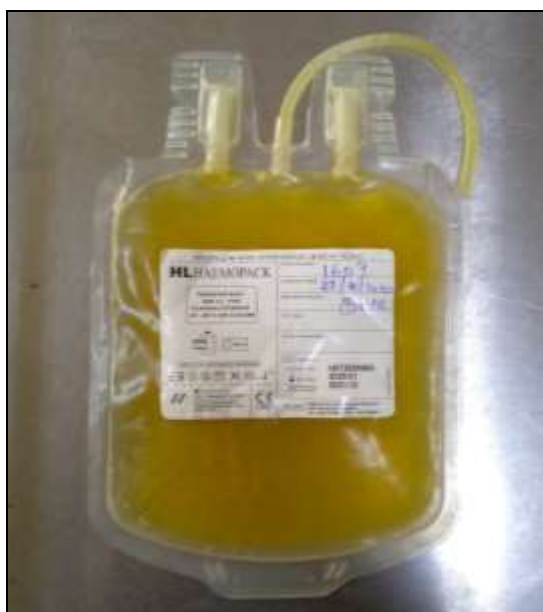
Fig 4: Transfer bag containing PRP prepared using double spinning technique.