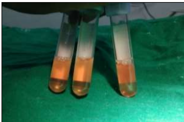
Fig 2: Vacutainers containing PRP prepared using single spin technique.