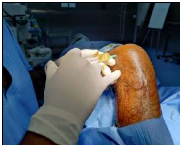
Fig 5: Infiltration of PRP into the joint.

dizziness. During follow-up period, no analgesics were allowed.