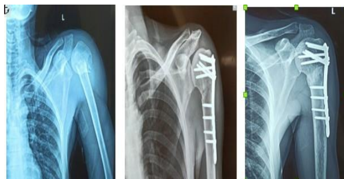
(g) X-ray: pre- op, immediate post op and 6 months follow up

Functional outcome evaluated with CONSTANT –MURLEY SCORE, we got excellent results in 04 cases, satisfactory in 09 cases, unsatisfactory in 05 and failure in 02 cases with a mean Constant-Murley score at the end of final follow-up period was around 80.2.