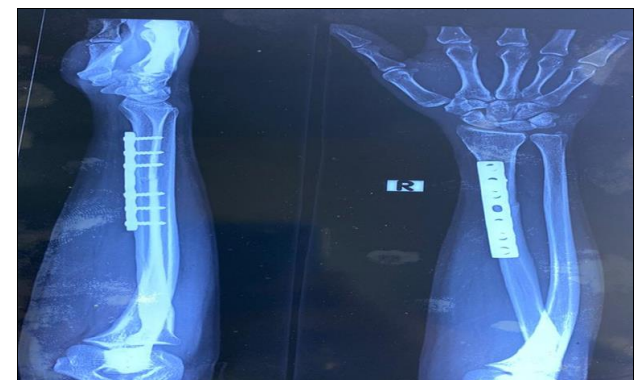
Fig 4: 6 months post op x ray