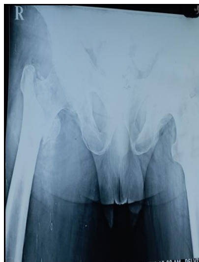
Fig 5: Pre-Operative