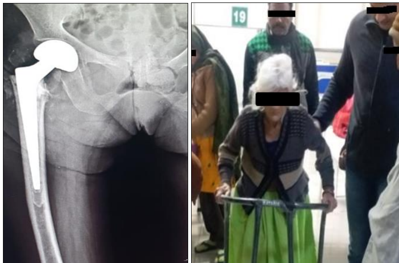
Fig 4: Post-Operative