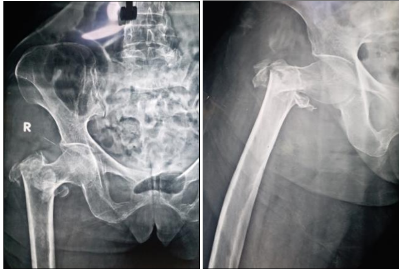
Fig 3: Pre-Operative