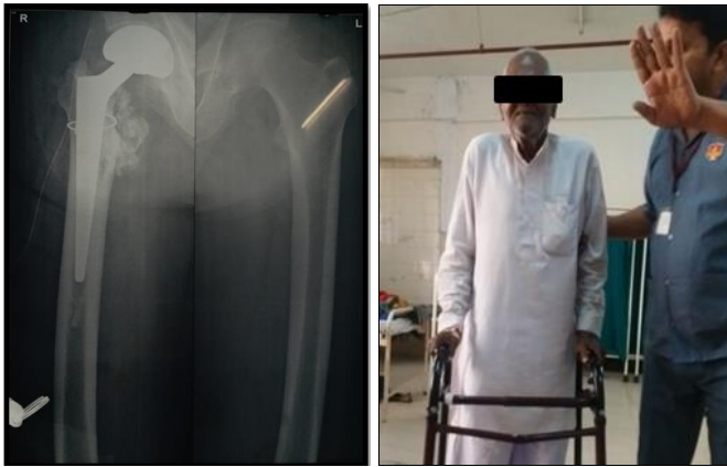
Fig 6: Post-Operative