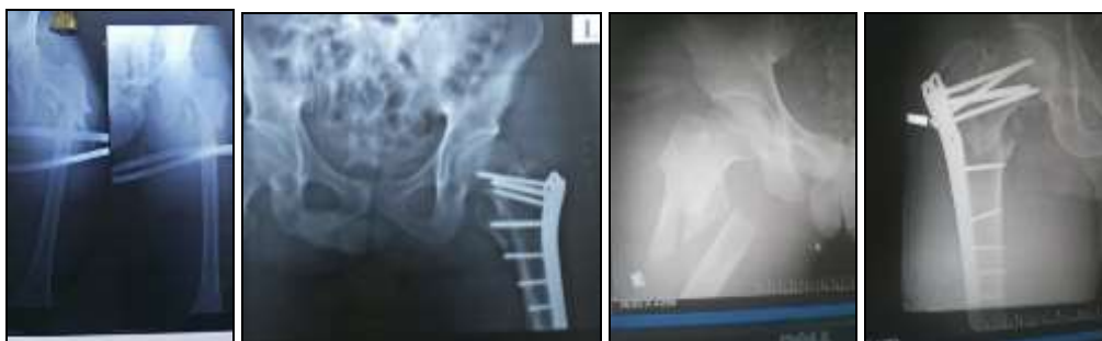
Fig 2: Pre and post op internal fixation

With 41 patients from G1 at final follow up, 28 patients were class 4, 10 patients were class 3, 2 patients were class 2 and 1 patients was class1.