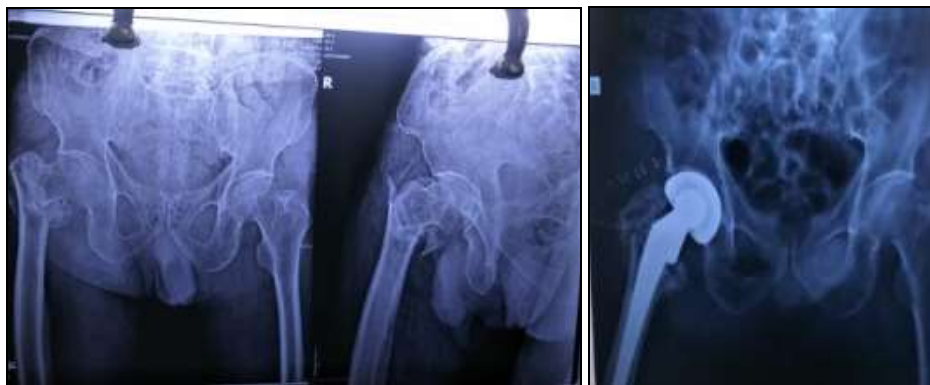
Fig 1: Pre and post op bipolar hemiarthroplasty

G2- internal fixation group (22 patients)