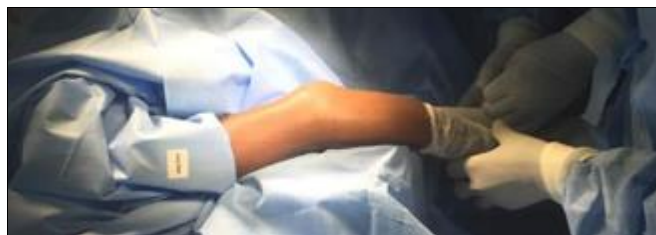
Fig 2: Technique of positioning, painting, and draping

anteroposterior as well as lateral views will be taken to confirm the reduction. Distal pulse is monitored throughout the procedure.