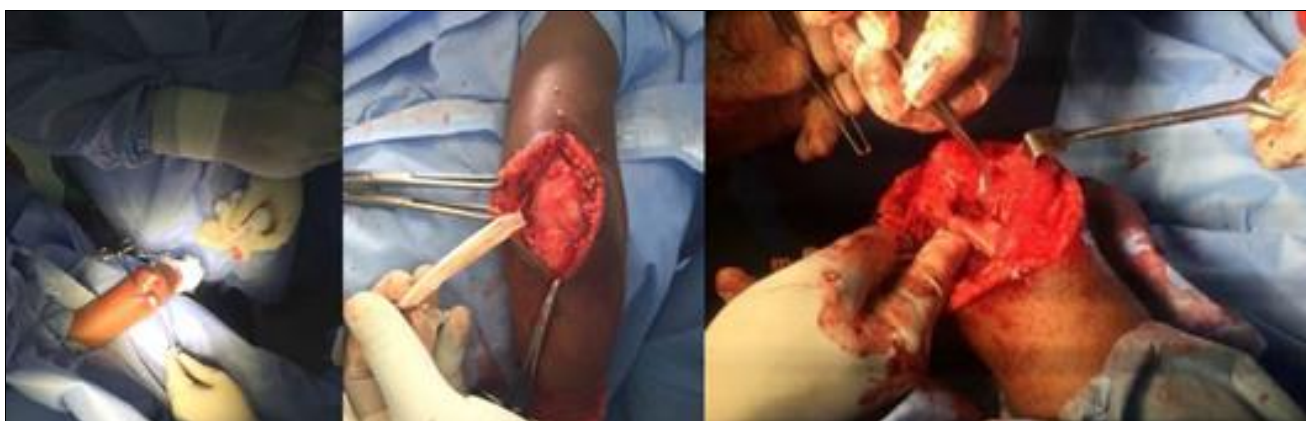
Fig 3: Technique of open reduction and internal fixation