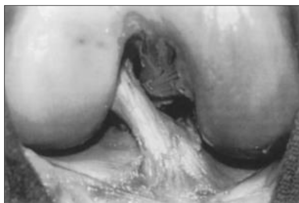
Fig 2: Cadaveric demonstration of ACL attachments on tibia and femur