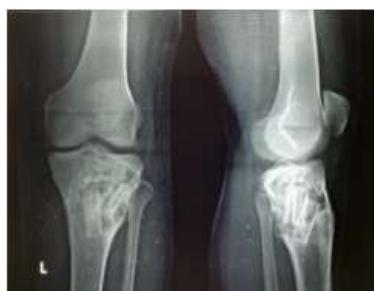
6 weeks post-op