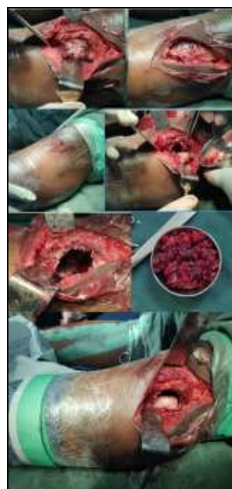
Fig 5: Intra operative pictures of curettage and bone grafting

Under spinal anaesthesia, in supine position, with application of pneumatic tourniquet, using lateral incision, curettage done and gap filled with cortico-cancellous bone graft using fibula and iliac crest harvest.