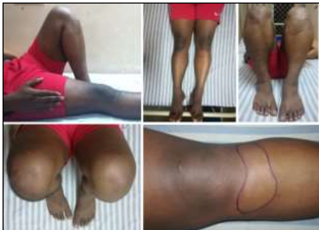
Fig 1: Clinical pictures showing extent of the lesion and movements