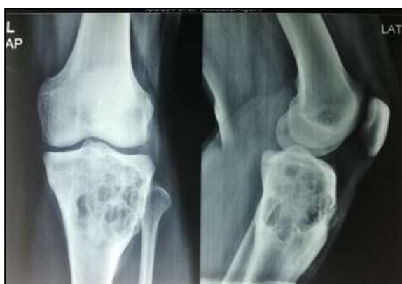
Fig 2: Fig: Pre-op X-ray

Large well defined expansile osteolytic lesion with multiple thin internal septations noted across epi and metaphysis of tibia with narrow zone of transition. No periosteal reaction or involvement of soft tissues.