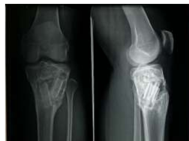
12 weeks' post-op