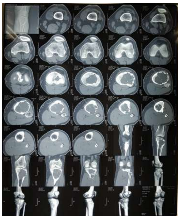
Fig 3: CT with 3D reconstruction

Large well defined expansile osteolytic lesion with multiple thin internal septations noted across epi and metaphysis of tibia with narrow zone of transition. No periosteal reaction or involvement of soft tissues.