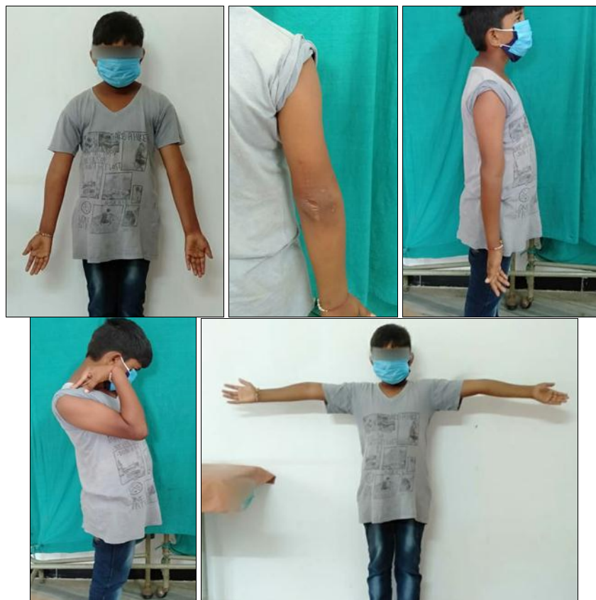
Fig 12: Post-operative Clinical Pictures

Results were graded according to Mitchell and Adams criteria [2] as under: