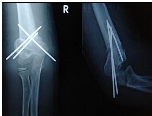
Fig 10: Post-operative radiograph