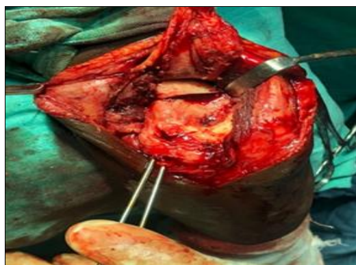
Fig 8: K-wires fixation to the osteotomy site