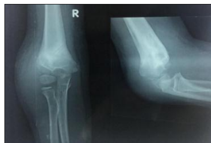
Fig 11: (6 months) follow up radiograph