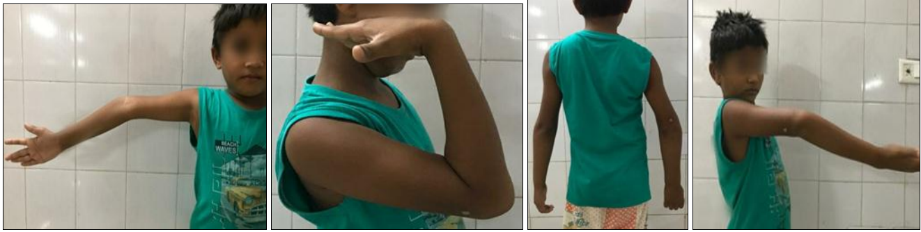
Fig 3: Pre-operative Clinical pictures