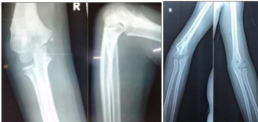
Fig 4: Pre-operative radiograph of affected and normal elbow.