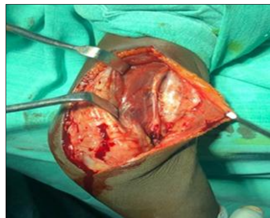
Fig 5: Isolation of ulnar nerve on the medial side