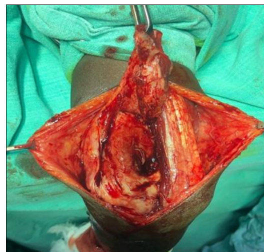
Fig 6: Posterior Triceps splitting approach with reflection of half of triceps on lateral side