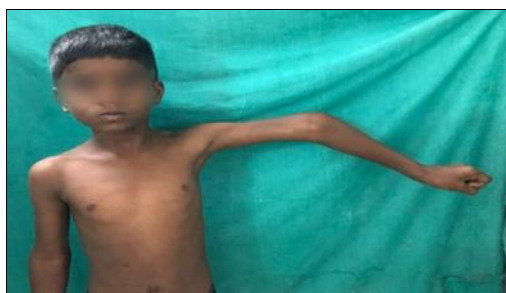
Fig 1: Cubitus varus deformity