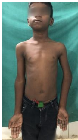
Fig 2: Obliteration of carrying angle with lateral angulation at left elbow.

Most of the cubitus varus deformity cases are static, triplanar and extra-articular. The deformity may be progressive in cases due to osteonecrosis of trochlea or growth arrest of medial condyle. The deformity becomes evident usually, ten to twelve weeks after the initial fracture. The deformity is noted by a definite varus with more than three months of history causing cosmetic deformity due to lateral condyle prominence. To manage this deformity various techniques of corrective osteotomies and fixation have been described. The corrective osteotomy options include medial opening wedge osteotomy [1], lateral closing wedge osteotomy (French Osteotomy) [10], dome osteotomy [18], step cut osteotomy, oblique osteotomy with derotation [7], penta lateral osteotomy [32]. The different methods of fixation of osteotomy include k-