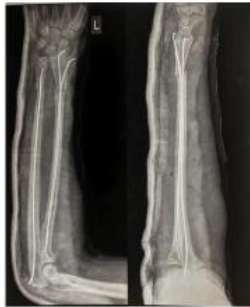
Immediate Post Op