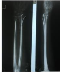
1 Month Old