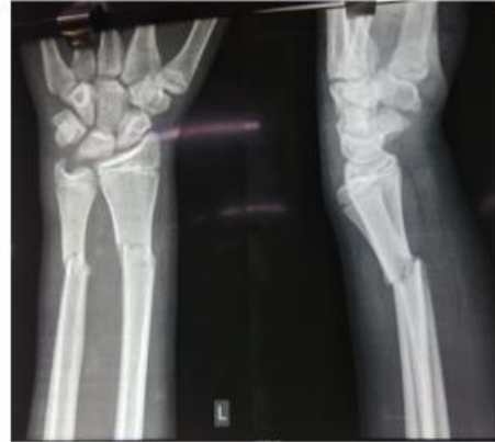
PRE OP XRAY