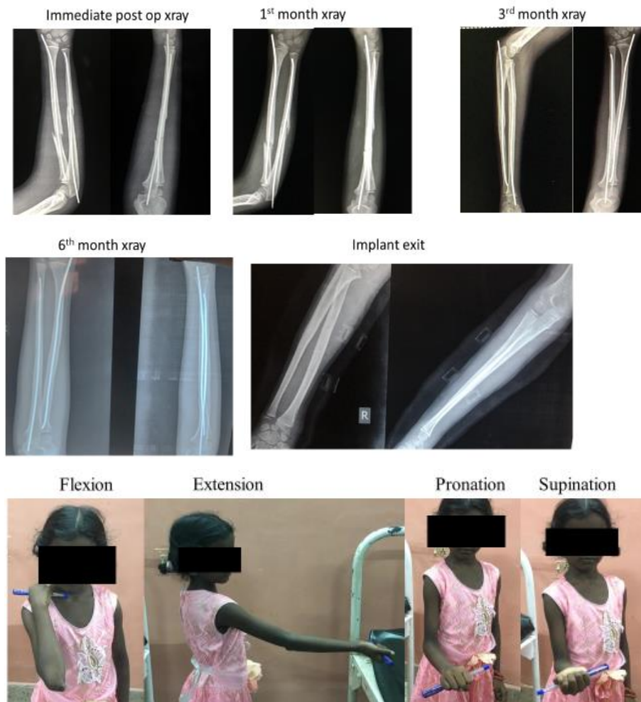
Case 2: (Paediatric group)