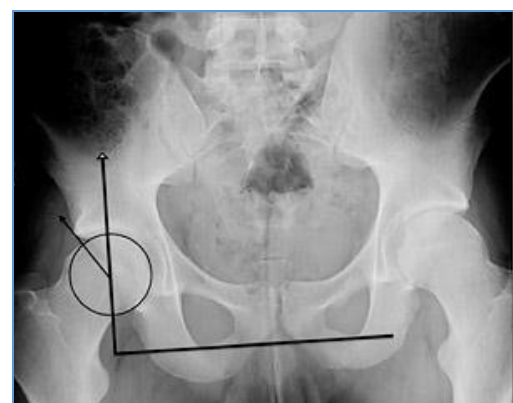
Fig 4: Measurement of CE angle on the x-ray mouse template