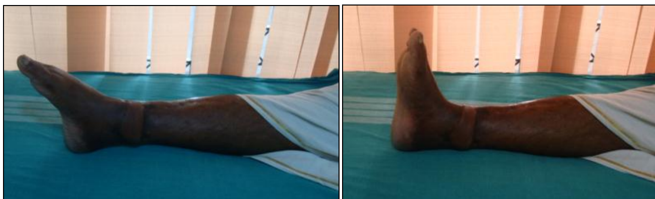
d) Ankle ROM at the end of one year