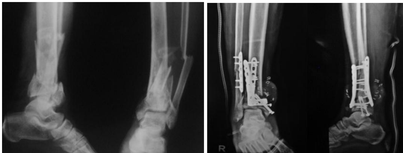
a) Pre op x ray grade 3 distal tibia and fibula fracture