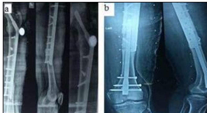
Fig 6: A &amp; B: Implant failure treated with retrograde nailing successfully

Therefore, one should be very cognizant of achieving proper length and rotation when using a retrograde femoral rod.