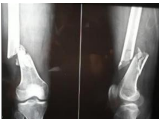
Fig 1: X-ray showed traumatic fracture at distal femur.

Technically the proximal locking in retrograde nailing can be demanding as the lateral target device often mismatch in proximal locking due to strong muscle forces. To negotiate this issue new nail designs are considering antero-posterior free hand locking option for proximal locking.