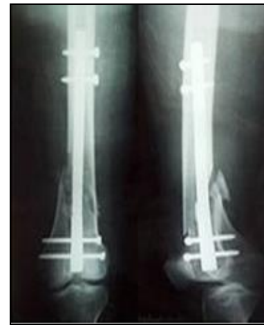
Fig 2: Postoperative radiographs of a distal third femoral shaft fracture treated with a retrograde interlocking nailing.