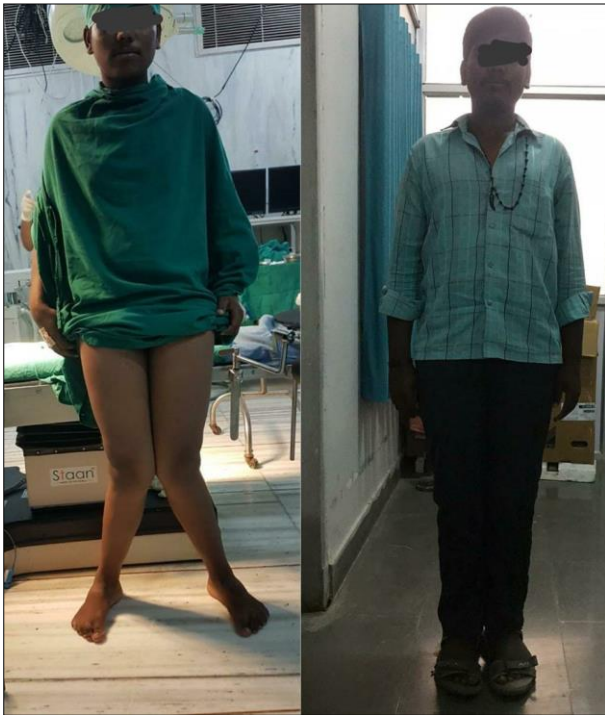
Fig 3: Pre-operative & Post-operative Clinical Photos