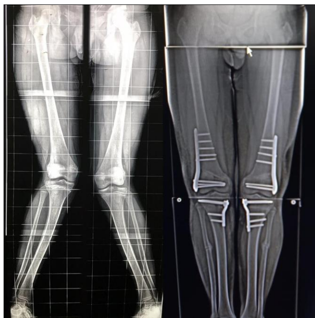
Fig 1: Pre-operative & Post-operative Scanogram

these patients passes through the normal stages of development with Physiological Genu Varum and Physiological Genu Valgum. For these patients no intervention is needed. Only counselling and reassurance to the parents and follow-up at appropriate intervals is sufficient. It is necessary to differentiate between physiological causes of angular knee deformity and others in order to prevent unnecessary and avoidable subjection of child to a surgical procedure which was not required at all. In the past techniques like corrective osteotomies with external or internal fixation were used for correction of angular knee deformities. As these techniques were more invasive nowadays less invasive techniques used for correcting deformity in immature children. Distal femoral Metaphyseal osteotomy corrects deformity at level of CORA with no need of any translation at osteotomy site. With intact medial cortical hinge and stable fixation, bone graft can be avoided without any risk of failure.