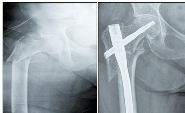
Fig 1: Subtrochanteric fracture of femur treated with proximal femoral nail

All patients were followed every month for first 3 month and after that once in three month for one year. At every visit patient were accessed clinically regarding hip and knee fixation, fracture union, shortening, deformity and ability to walk. For evaluation modified Harris hip score was used [9].