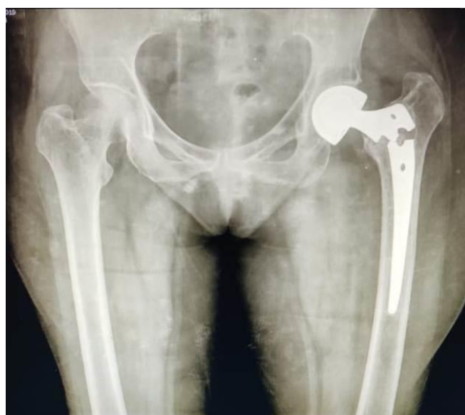
Fig 3: Post-operative implant breakage during follow up