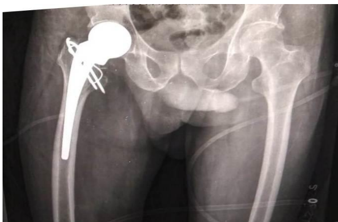
Fig 4: Greater trochanteric fracture managed with tension band wiring with k wires

In this study, intra-operative iatrogenic fractures occurred in 10.6% patients (14 patients were having greater trochanteric fractures and 2 had femoral shaft fractures), these patients managed with tension band wiring with k wires (Figure 4) and LCDCP plate with cerclage wiring respectively. Choon Chiet Hong et al. reported intra-operative iatrogenic fractures in 10.3%. We found almost the same rate of complications in our patients [11].