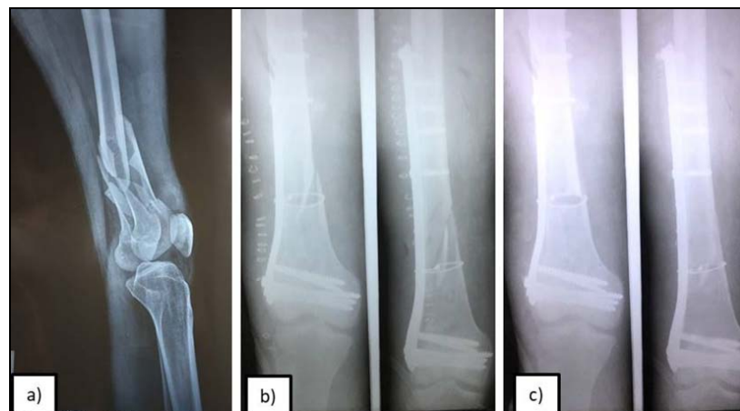
Fig 2: Radiograph a) Preoperative, b) Immediate Postoperative, c) Postoperative 6 months