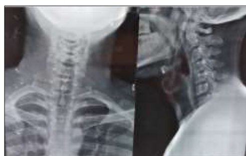
Fig 1: Pre operative radiographs of cervical spine

Plain X-rays and MDCT of C-spine showed decreased disc height at C4-C5 level with focal kyphosis 15 degrees in the cervical region. MRI showed right paracentral C4-C5 disc protrusion with obliteration of functional reserve of CSF, and T1- and T2- hyper-intensity in cord at that level with no evidence of haematomyelia.