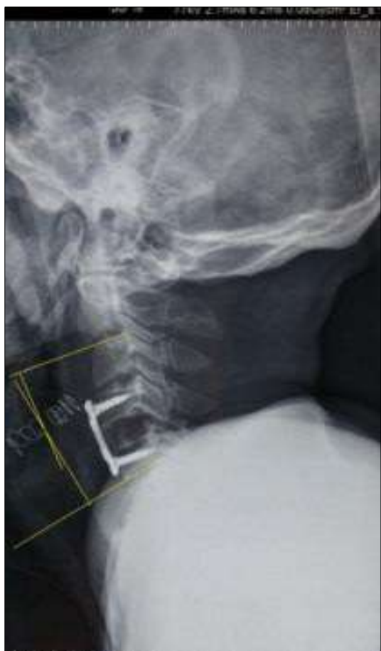
Fig 7: Restoration of cervical lordosis after surgery

Patient and his kin were explained about the need for surgical intervention and Pre-anaesthetic work-up started.