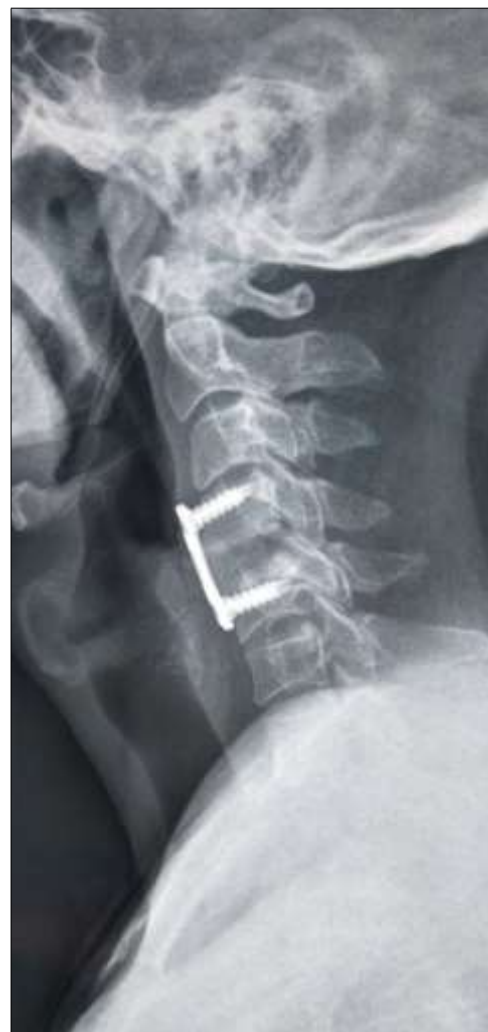
Fig 8: 3 month follow up radiograph showing maintained cervical lordosis and evidence of bony fusion between C4-C5 bodies