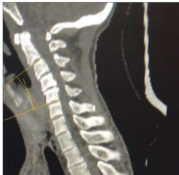
Fig 2: CT scan (Mid sagittal) showing no bony involvement and Pre-operative focal kyphosis of 15 degrees