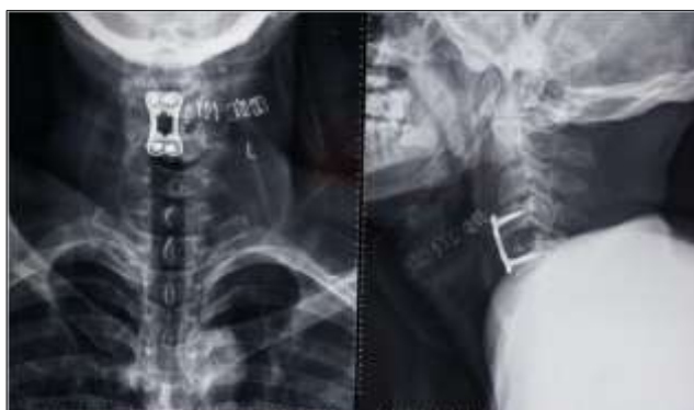
Fig 6: Post operative radiograph after ACDF at C4-C5