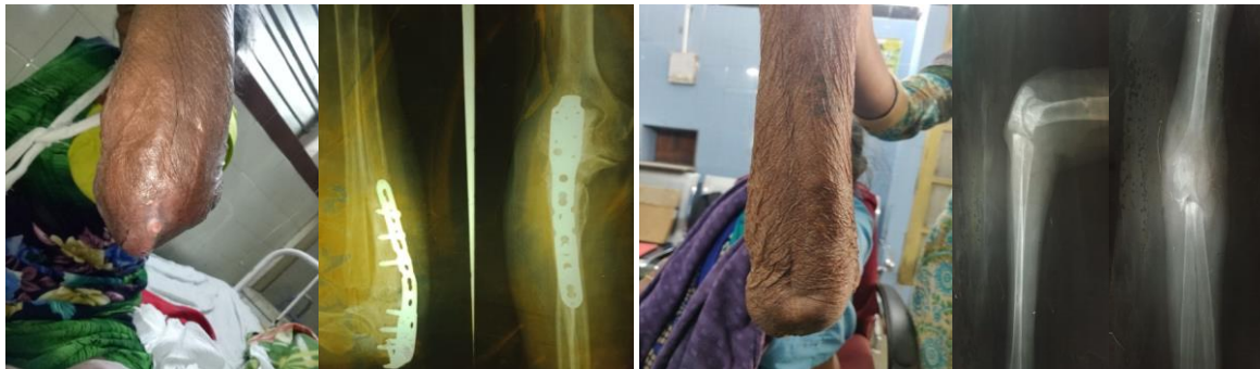
Fig 1: Clinical pictures & x-rays of the patient with unfavourable outcome.