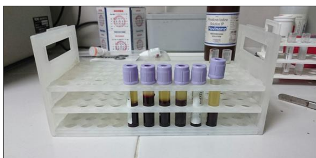
Fig 3: Vacutainers after 15 minutes of centrifuge with 1500 RPM