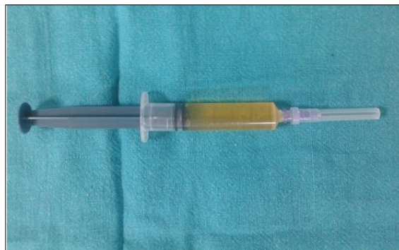
Fig 4: PRP of 4ml activated with 1ml of CaCl 2 , total 5ml of activated PRP in syringe