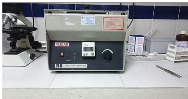
Fig 2: Centrifuge for PRP separation with timer on the front side

During the follow-up period, nonsteroidal anti-inflammatory drugs were not allowed, and tramadol (dosage, 50 mg bds) was prescribed in case of discomfort; all patients were asked to stop medications 48 hours before follow-up assessment.