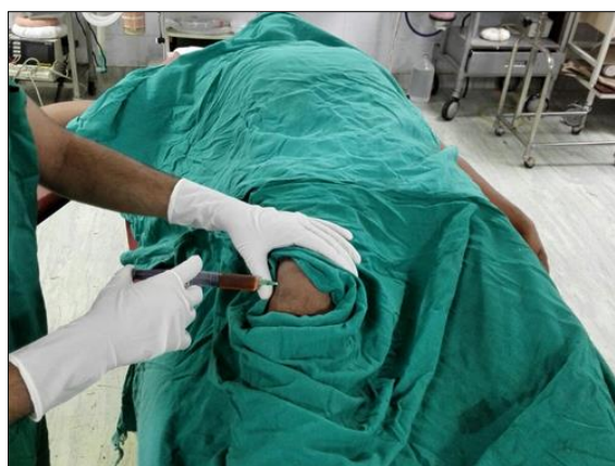
Fig 5: infiltration into the knee joint in Operation Theater