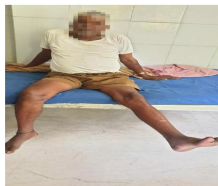
Fig 5, 6, 7: Illustration at 6 month follow-up (Flexion, Extension, Abduction)