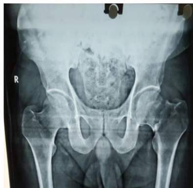
Fig 3: Pre-op Radiograph