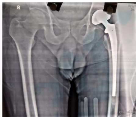
Fig 4: Post-op Radiograph