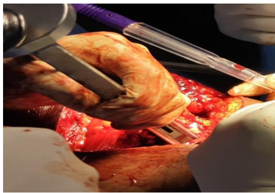
Fig 2: Prosthesis snug fit over calcar femorale