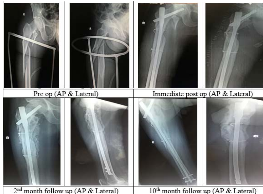
Fig 2: Radiographs of subtrochanteric fracture fixed with PFN-A2