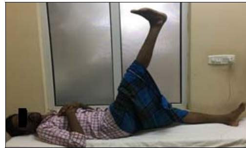
Fig 3c: Hip flexion with knee extension

A total of 20 cases of subtrochanteric fractures underwent surgical management with proximal femoral nail antirotation 2 (PFN-A2) as per our study protocol. The descriptive statistics were reported as mean (SD) for continuous variables, frequencies (percentage) for categorical variables. Data were statistically evaluated with IBM SPSS Statistics for Windows, Version 24.0, IBM Corp, Chicago, IL. Among 20 cases, 13 cases (65.00%) were males and 7 cases (35.00%) were females. The maximum age limit in the study was 69 years and minimum age was 33 years. The mean ( \pm SD) age of the patients were 47.81 \pm 3.61 years. A total of 11 cases (55.00%) sustained injury due to road traffic accident and 9 cases (45.00%) due to fall from height.