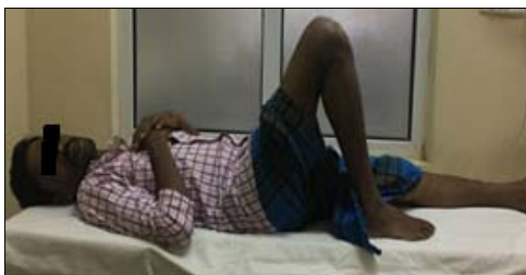
Fig 3a: Hip flexion with knee flexion