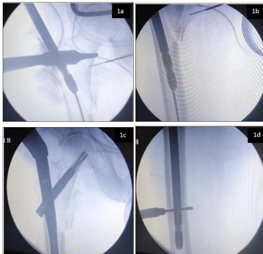
Fig 1: Surgical technique of PFN-A2 for subtrochanteric fracture

All the patients were advised to completely weight bearing after 10 – 12 weeks of post operative period. All patients were followed up at the end of 1, 2, 6 and 12 months. At each follow up, the radiographs of upper femur and hip were taken