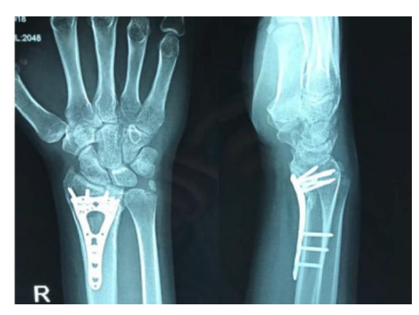
Fig 4: Immediate Post OP