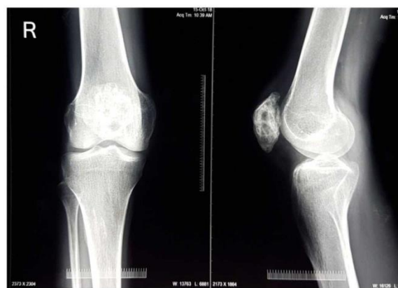
Fig 3C: Post op. Xrays at 2 month