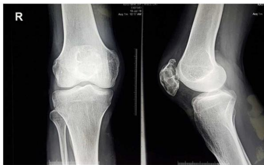
Fig 3A: Pre op. Xrays