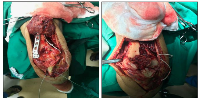
Fig 1: Intraoperative Images.

Lateral plating was done in 6 patients, and medial and lateral parallel plating was done in 12 patients. The olecranon osteotomy was fixed with a tension band wiring or 1 cancellous screw.