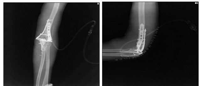
Fig 2: Post Operative X-rays.

In group B of triceps lifting approach to the elbow joint, a posterior skin incision to elbow was made, and the ulnar nerve was then exposed and protected. The triceps muscle from the attachment site was detached and lifted in a “V” form with the fascia and the muscle was split up to the condyles. The fracture line was visualized and reduced with bone holding clamps and provisionally fixed with K-wires, and lateral plating was done in 3 patients and medial and lateral parallel plating was done in 9 patients. The triceps muscle was sutured to its anatomical site using a 1.0 absorbable suture.