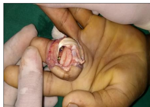
Fig 6: Hamate autograft in place and screws