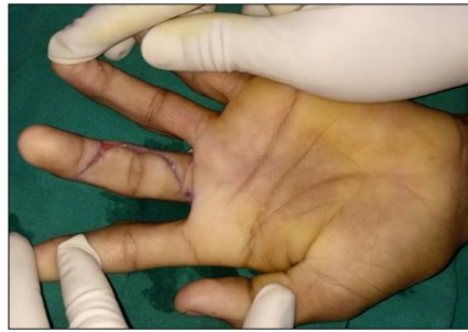
Fig.7 Reduction joint after Graft