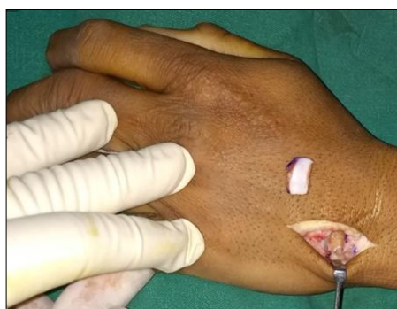
Fig 5: Graft is harvested from the dorsum of the hamate.