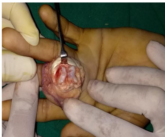
Fig 3: Joint is bent dorsally 150° (shotgun approach) and the joint surface, Fracture site becomes visible.