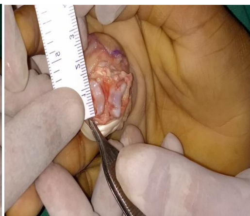
Fig 4: Dimensions of the bony defect are measured