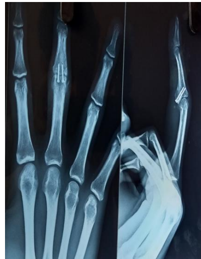
Fig 9: Post op. (5 week)-complete graft union