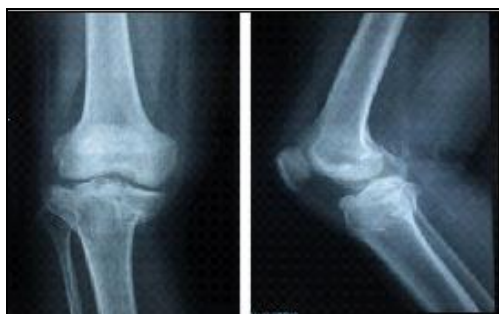
Fig 2: Case Study, Pre-Op Xray