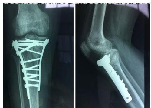
Fig 3: Post Op X Ray