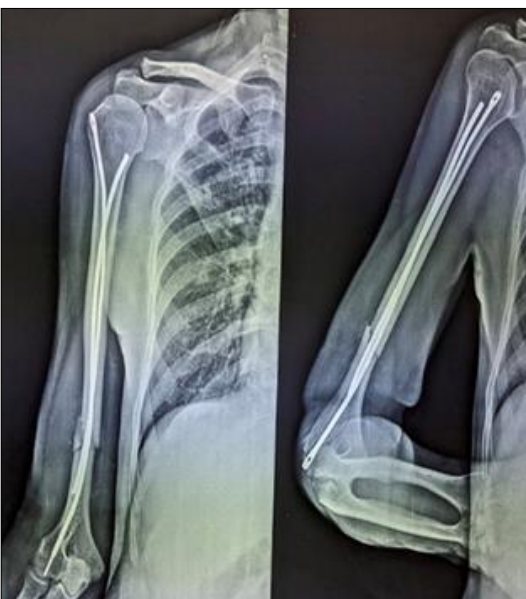
Fig 3: 2 Weeks follow up