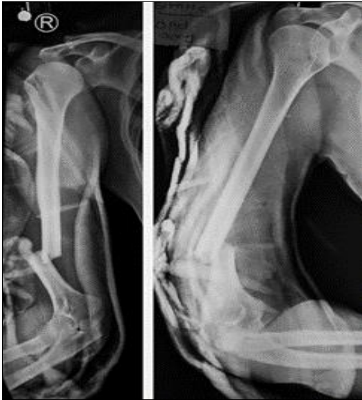
Fig 1: preoperative x-ray