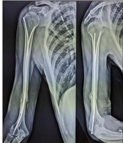
Fig 4-6: Weeks follow up