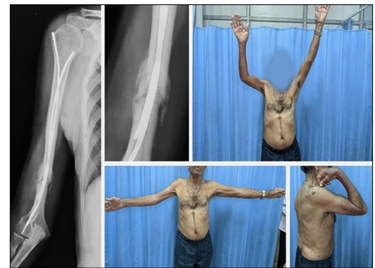
Fig 5-10: Weeks follow up