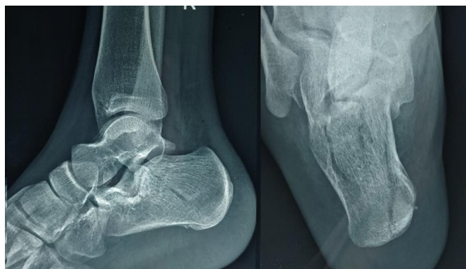
Fig 3: Sample x-rays of patient at the time of injury

The study had limitations such as the limited number of cases, due to which obtaining statistically significant inference was difficult. Both open and closed cases were included in the study and considered together for outcome analysis. The outcome was not analyzed as per Sander's classification since the number of cases were few. Limited follow-up period of one year does not allow us to generalize the results.