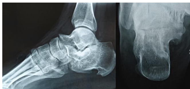
Fig 4: Sample x-rays of patient at 1 year follow-up with good functional outcome score