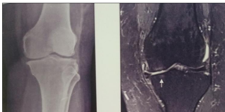
1. X ray showing KL grade 2 changes 2. MRI coronal PD fat sat image showing grade 3b cartilage loss

MRI) respectively. Among 8 patients of grade 1 K-L score, 2, 2, 2 and 2 patients had grade 0, grade 2A, grade 2B and grade 3A Cartilage abnormality (On MRI) respectively. Among 14 patients of grade 2 K-L score, 1, 4, 4 and 5 patients had grade 2A, 2B, 3A and grade 3B cartilage abnormality (On MRI) respectively. Both grade 3 K-L score patients had grade 3B Cartilage abnormality (On MRI).