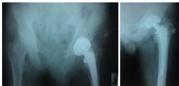
After 1 Yar Follow Up