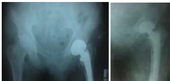
Immediate Post-Operative Radiograph