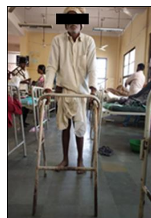
Immediate Post Op