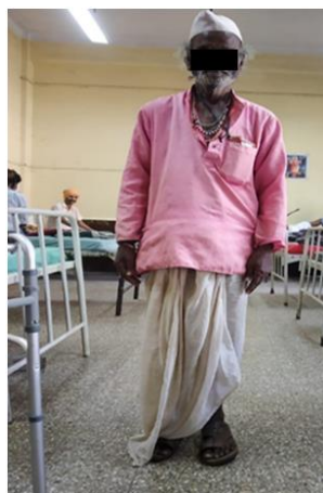
Full Weight Bearing