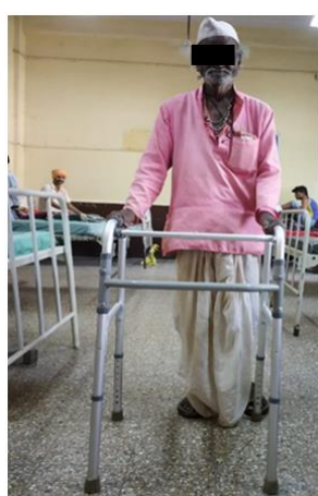
Immediate Post Op