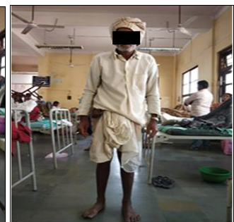
Full Weight Bearing