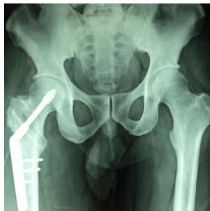
Immediate post-operative x-ray