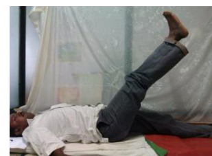
Active straight leg rising

Finally, the two techniques were compared for excellent and less than excellent result which showed An Odds ratio of 2.1666 (at 95% CI 0.7167 – 6.5502).