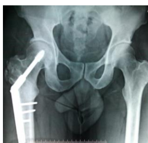
6 months follow-up x-ray