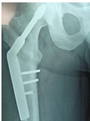
6 weeks follow-up x-ray