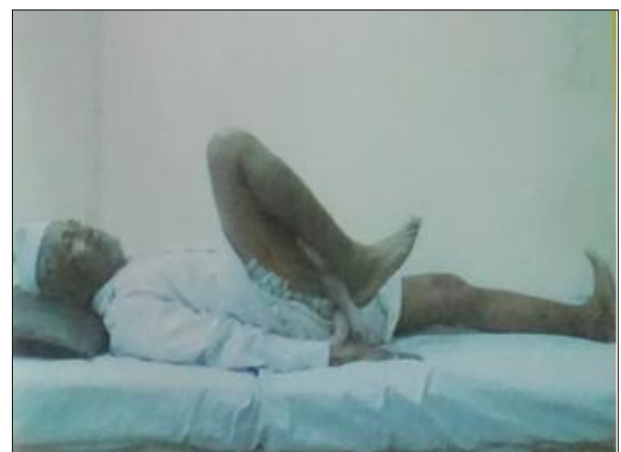
1D: Hip and knee flexion