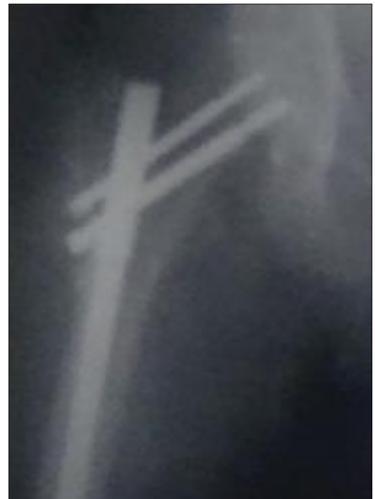
1C: Fracture union