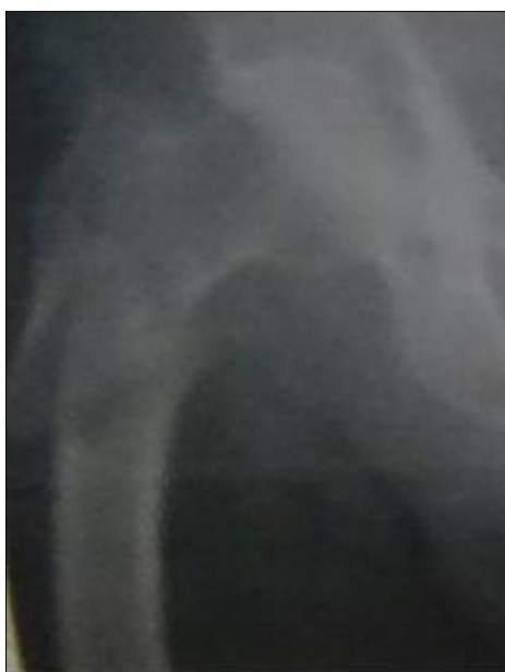
1 A: Pre-operative