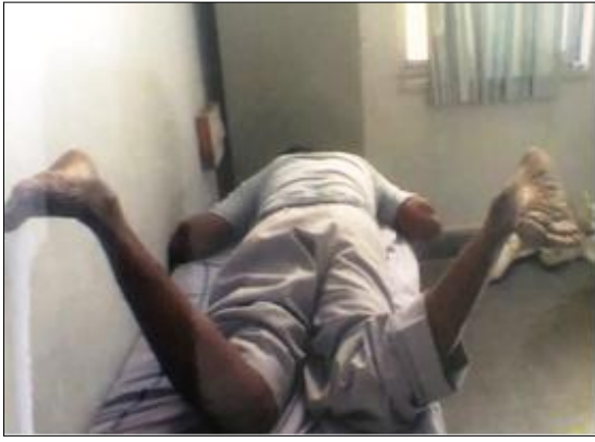
2E: Hip internal rotation