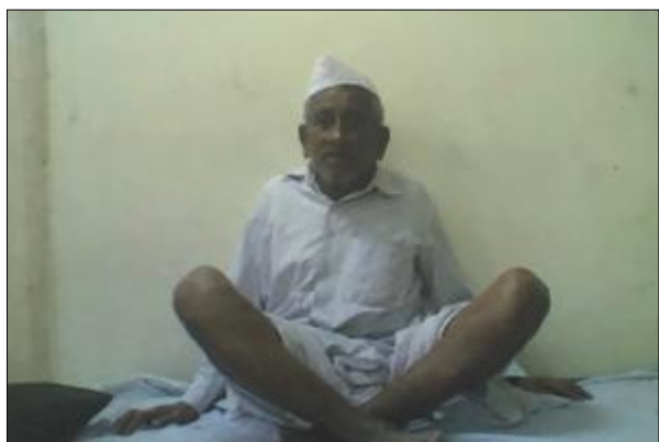
1H: Hip external rotation