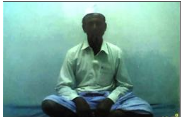
3E: Hip external rotation