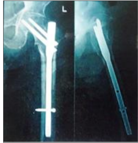
3C: Fracture union