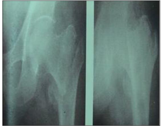
2 A: Pre- operative