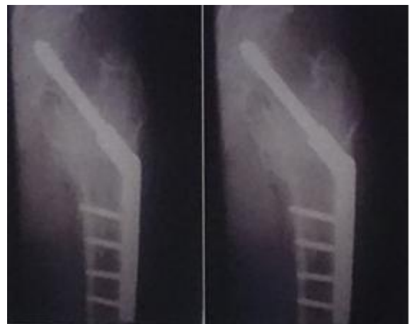
2C: fracture union