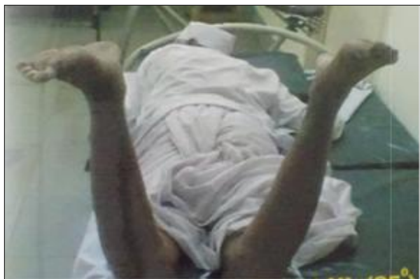
1G: Hip internal rotation