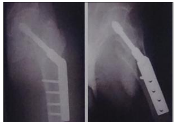
2B: Post- operative