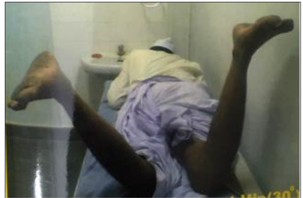
3D: Hip internal rotation