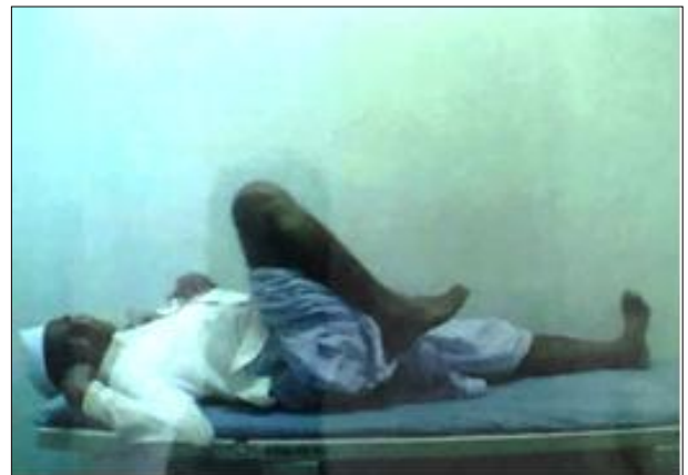
3F: Hip and knee flexion