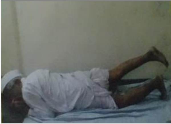
1E: Hip extension