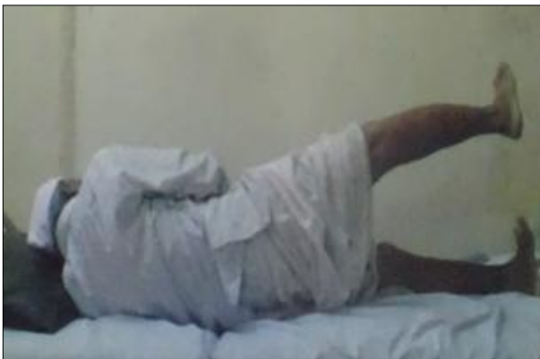
1F: Hip Abduction