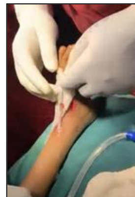
Fig 11: Tendon re-rooted laterally long subcutaneous tunnel