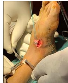
Fig 9: Detached from insertion

Lateral view shows correction of equinus deformity (plantigrade foot).