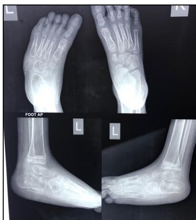
Fig 8: Post op X rays

Contributed by unapposed Invertors (tibialis anterior) and weak everter (peronei).