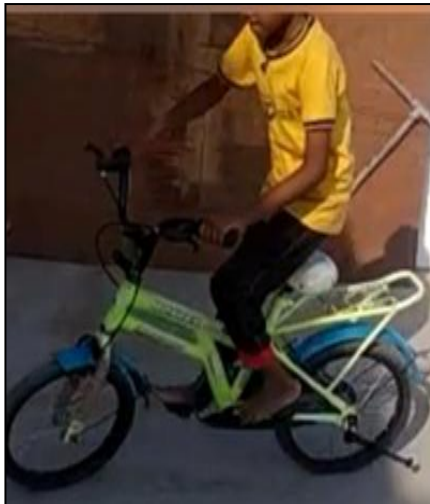
Fig 14: Final Post OP results