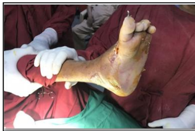
Fig 6: Implant removal and FHL/FDL tenotomy and Abductor Hallucis release