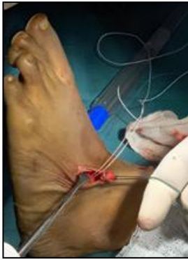
Fig 13: Tendon reinserted on third cuneiform bone