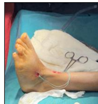
Fig 12: Tendon taken out from Extensor retinaculum proximally