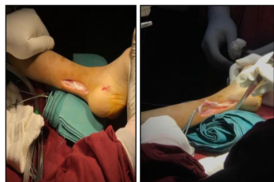
Fig 2: Steindlers Release