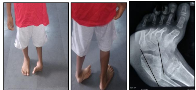
Fig 1: Pre-op photos and X ray

Maqdoom et.al.in their study of CTEV correction by Ilizarov assisted distraction histogenesis in age group of 8 years to 12 years has shown excellent functional outcome in 71 percent of subjects. There was need of tendo Achilles lengthening and plantar fascia release as it was tight. Ilizarov construct was kept for mean time of 3.6 months; it was 3 months in our patient.