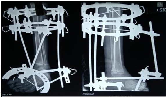
Fig 5: post op x ray