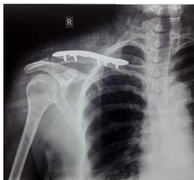
Fig 4: Follow up x ray showing fracture union clavicle proper aspect