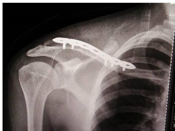
Fig 3: Post operative x ray displaying fracture clavicle proper facet fixed with locking plate.