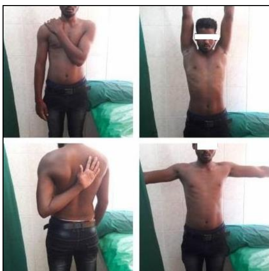
Fig 5: Follow up range of movements.