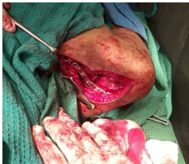
Fig 1: Intra operative photograph showing fixation with locking compression plate.

and by way of 18 weeks all of the cases united except one case. In our study 22 patients back to day to day activities after 8 weeks and three patients returned to work after 3 months. We had complications of hard ware irritation in one case, infection in another case. 2 patients had screw pullout. One nonunion and no refracture in our patients. We removed the plate and screws in 1 case after infection.