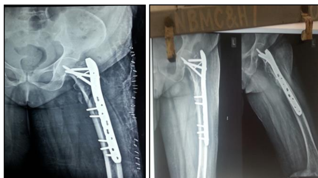
Immediate post op Follow up after 6 months