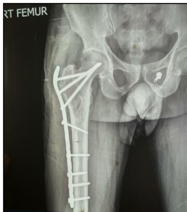
12 months follow up of Proximal femoral locking plate done in MIPO technique in subtroch femur fracture