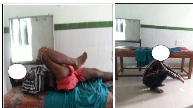
Clinical photograph in a PFN at 6 months post-op