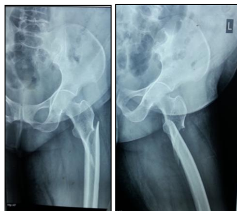
Pre op X-ray