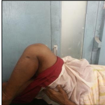
Clinical photograph of PFLP at 6 months of follow up