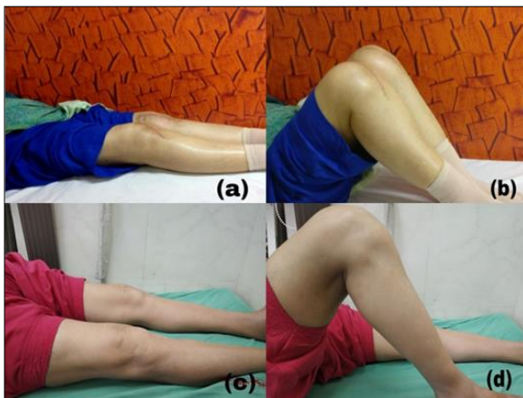
Fig 4: Follow up of the patient at 6 weeks showing a) extension and b) flexion at knee respectively and follow up at 1 year showing c) extension and d) flexion at knee respectively.