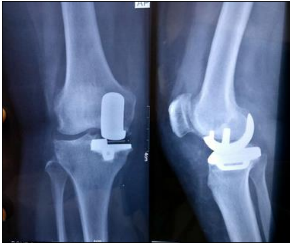
Fig 3: Post operative X-ray (AP and Lateral views) with implant in situ.