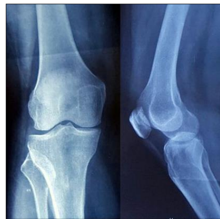
Fig 1: Anteroposterior view of knee (in standing position) and lateral view showing reduced medial joint space

Post operatively intravenous antibiotics were continued for first 2 days and then changed to oral antibiotics for next 10-12 days. Drain was placed in all the patients to calculate the amount of blood loss. First dressing with drain removal was done on 3 rd post-operative day and patients used to be discharged after 2 days of hospitalization post-operatively. Mobilisation of ankle joint, active toes movements were started on the same day of surgery, knee bending exercises, quadriceps static exercises for 1 st two post op days and then dynamic quadriceps exercises were taught to the patients. Suture removal was done on day 14. Patients were followed up [Figure 4] on 1 st week, 2 nd week, 4 th week, 8 th week, 3 rd month, 6 th month and 1 year and patients were assessed for pain using verbal pain score, ROM of the knee joint, clinical examination and the post op radiographs and finally WOMAC score was calculated and recorded.