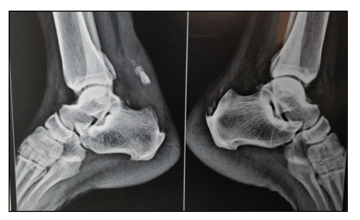
Fig 1: Preoperative Xray.

Patients were followed up and foot functions were assessed with FOAS and AOFAS hallux scores at 12 weeks.