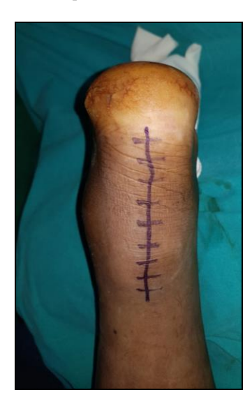
Fig 4: Incision line marked.