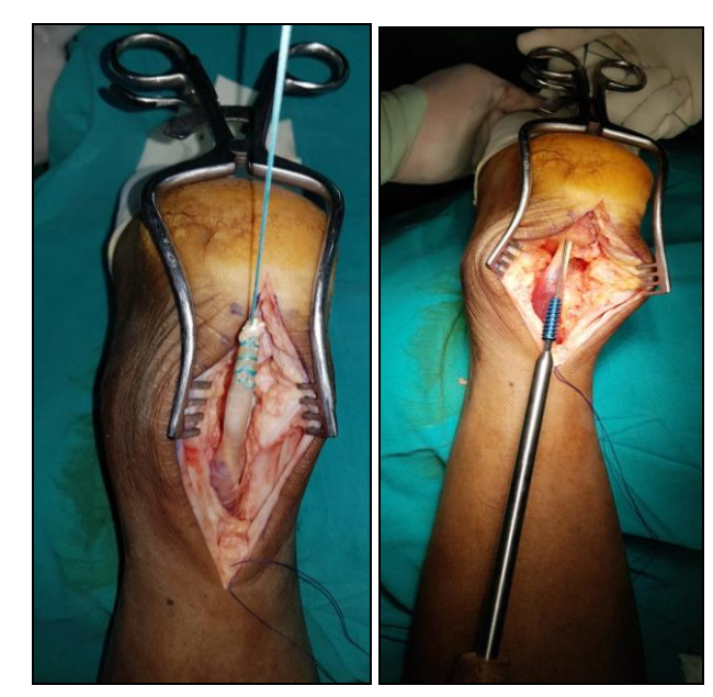
Fig 6: Whip stitch taken with Ethibond.