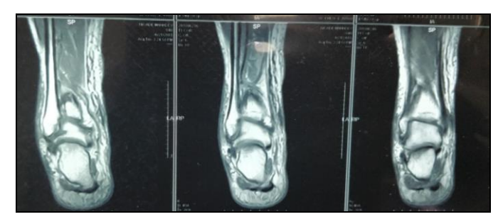
Fig 3: Preoperative MRI scans Coronal