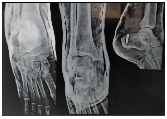
Fig 9: Post-operative Xray showing Tenodesis screw