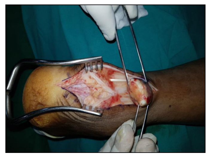
Fig 5: Debridement of CAT tears.