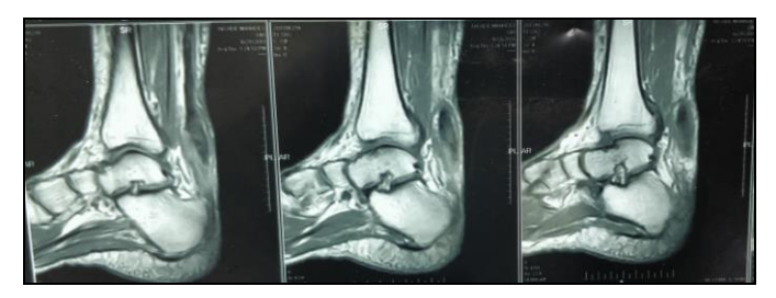
Fig 2: Preoperative MRI scans Saggital