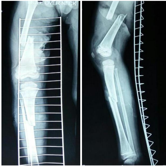
Fig 1: Pre-operative Xrays

dislocating patella laterally and was found to have bicondylar coronal split of femoral condyles. Fractures were reduced with k wire (Joy stick method under direct vision) and fixed with three cannulated screws (Extra-physeal) along with close reduction and fixation of tibia using ender's nail.