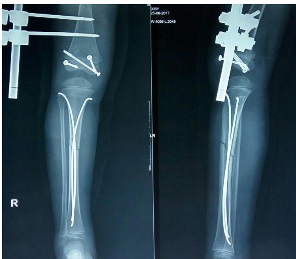
Fig 3: Post-operative xrays showing Fixation of conjoint bi condylar Hoffa fracture using cannulated cancellous screws.

Post operatively patient was kept on below knee plaster for 2 weeks after which knee mobilisation was started. Weight