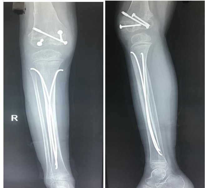
Fig 4: Xrays at union 3 months

bearing was delayed in view of fracture of femur and tibia. Knee Range of motion gained at 12 weeks post operatively was 0-130 degrees actively.