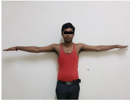
a) Shoulder Abduction