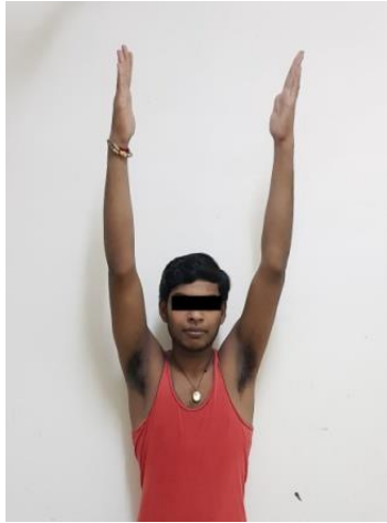
b) Over Head Shoulder Abduction