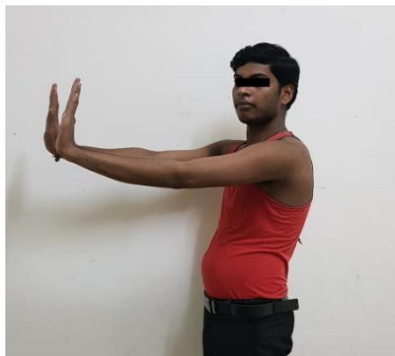
c) Elbow Extension with Wrist Dorsiflexion