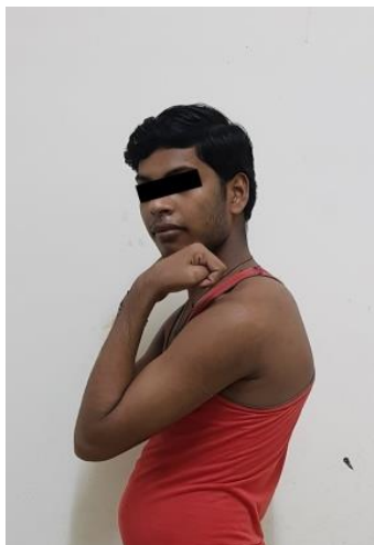
d) Elbow Flexion