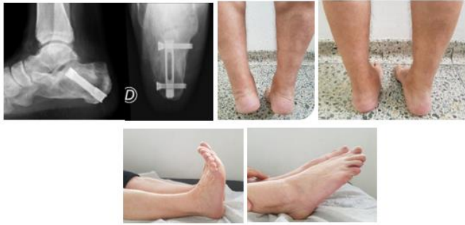
Fig 2: Radiologic and functional postoperative results, after 1 year of calcaneal nail fixation.

Figure 2 shows radiological improvement, and figure 3 functional improvement after 1 year of calcaneal nail fixation. Two patients were submitted to an implant removal, one for subtalar complaints, other for insurance company decision. One patient with open fracture had a deep infection treated conservatively, one patient had a transient sural neuropraxia. We had no skin complications, implant failure or conversion to arthrodesis as well as other surgical procedures. Although the global incidence of complications was 23% (3/13), only in 15% (2/13) of the patients the complications were directly related to the surgical procedure, and only 8% (1/13) were severe enough to require a new intervention.