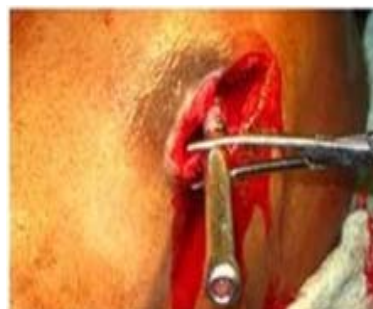
4e. Lateral glide of the lag screw.