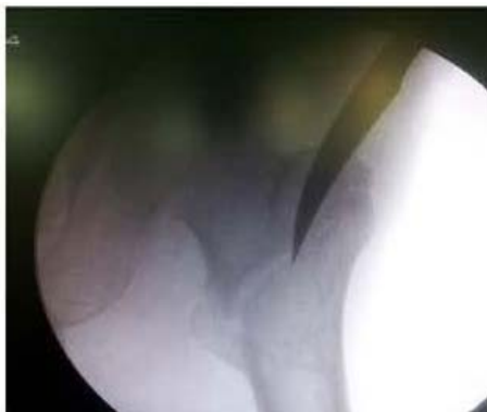
Fig 3b: Entry point with bone awl – AP C-arm view.

A 3 cm incision is made proximal to the tip of greater trochanter. Skin with subcutaneous tissue and deep fascia are incised. Gluteus maximus was split by blunt dissection. The tip of trochanter is then felt with finger