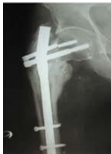
4d. Implant failure with malunion.