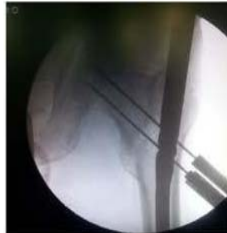
Fig 3d: Guide pin- AP- C-arm view

Reduction of the fracture was essential before making the entry point. After confirming the anatomical reduction, entry point is made with a bone awl over the tip of greater trochanter. After confirming the position in AP and lateral views, the awl was driven just proximal to the level of lesser trochanter.