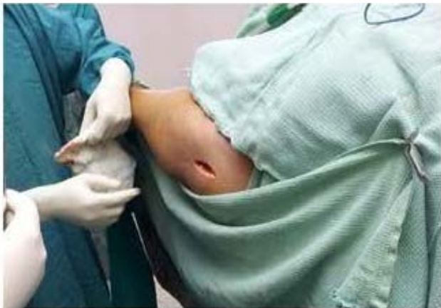
Fig 3a: Incision