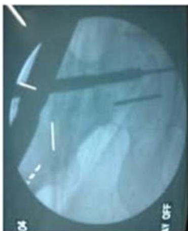
4a. Intra-operative drill bit breakage.