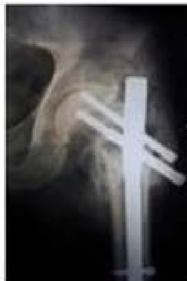
4c. Infection with 'Z' effect.