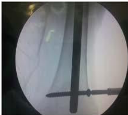
Fig 3g: Distal targeting.