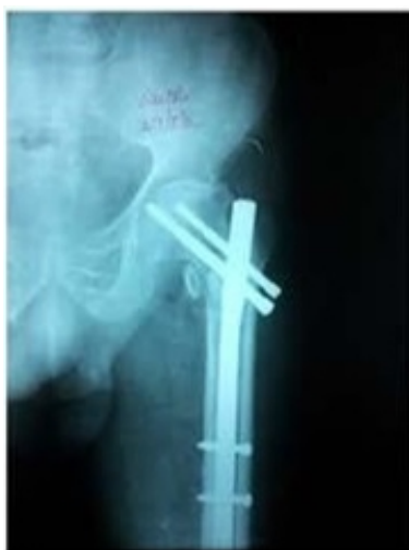
4b. Reverse 'z' effect.