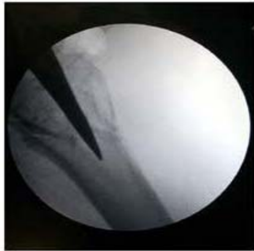
Fig 3c: Entry point with bone Lateral – C-arm view.