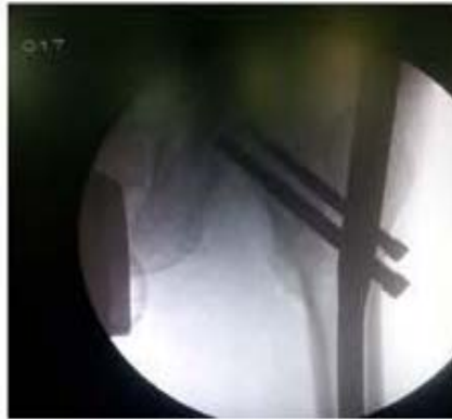
Fig 3f: Proximal targeting.

The nail that was in close match to the neck shaft angle of the un-affected hip is assembled in the zig. The PFN is slowly inserted upto the appropriate depth in order to allow placement of two screws within the femoral neck.