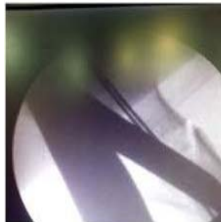
Fig 3e: Guide pin – lateral – C-arm view